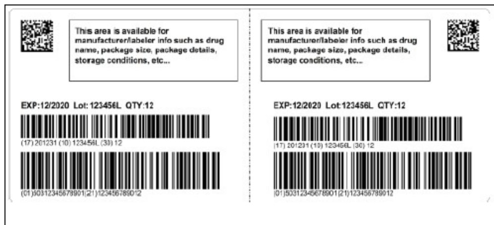
Example of Rx Serialized Homogenous Case Label