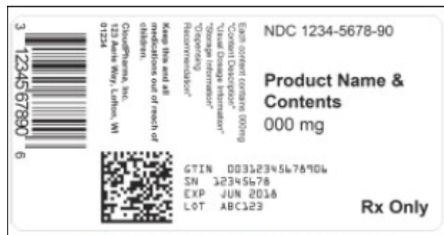
DSCSA RX Serialized Unit Label