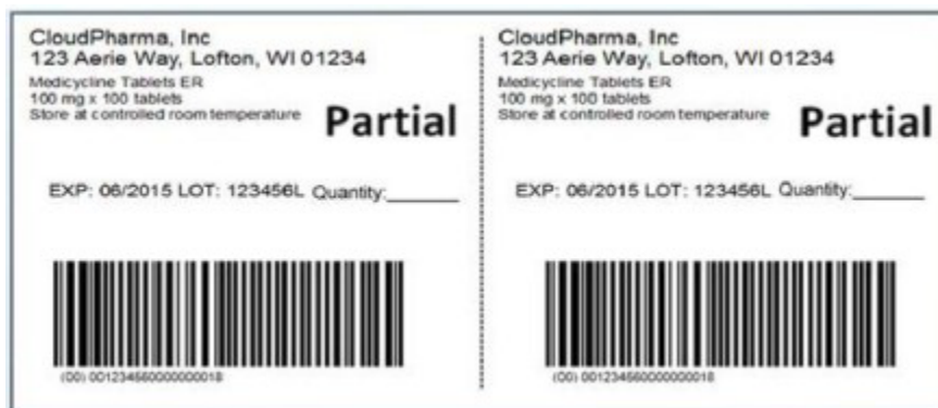
Example Partial Case Labeled with SSCC